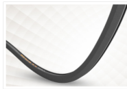
DUO® – XS (Hexagonal Wrap Belts)

Special construction, highly durable, Banded Wrap Belts designed for high tensile strength, high power transmission and compatible with reverse idler.