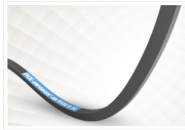
PIX-Enforcer® – XS (High-power, High-strength, Inversely Flexible Wrap Belts)

High tensile strength and high wear resistance outer cover. Specially designed for reverse idler applications.