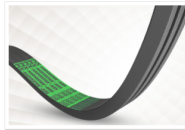
PIX-Harvester® – HXS (Heavy-duty, High-power, Banded Wrap Belts)

PIX Combine Harvester Belts are designed as per international Standard norms and are widely used in the market for long-life, low maintenance operation while providing a compelling performance to price ratio.