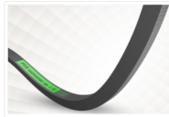
PIX-Harvester® – XS (Agricultural Wrap Belts)

Double-sided V-belts designed for multi-pulley, twin-power frictional drives.